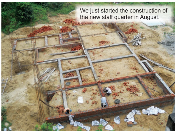
We just started the construction of the new staff quarter in August.

It was planned to build a new staff quarter as well, for the incoming teachers for this year as the existing residential building is full to its capacity. However, the contractor could not start the work on this new building as he had to get the school building ready before the starting of the new academic year. Now that the main works in the school building is over, he has started the work on the Staff Residence. We hope to get this building ready as early as possible, so that the new teachers could move in. The compound around the land is open and often animals and people get inside the compound. This is also something we have to think about, in the near future.