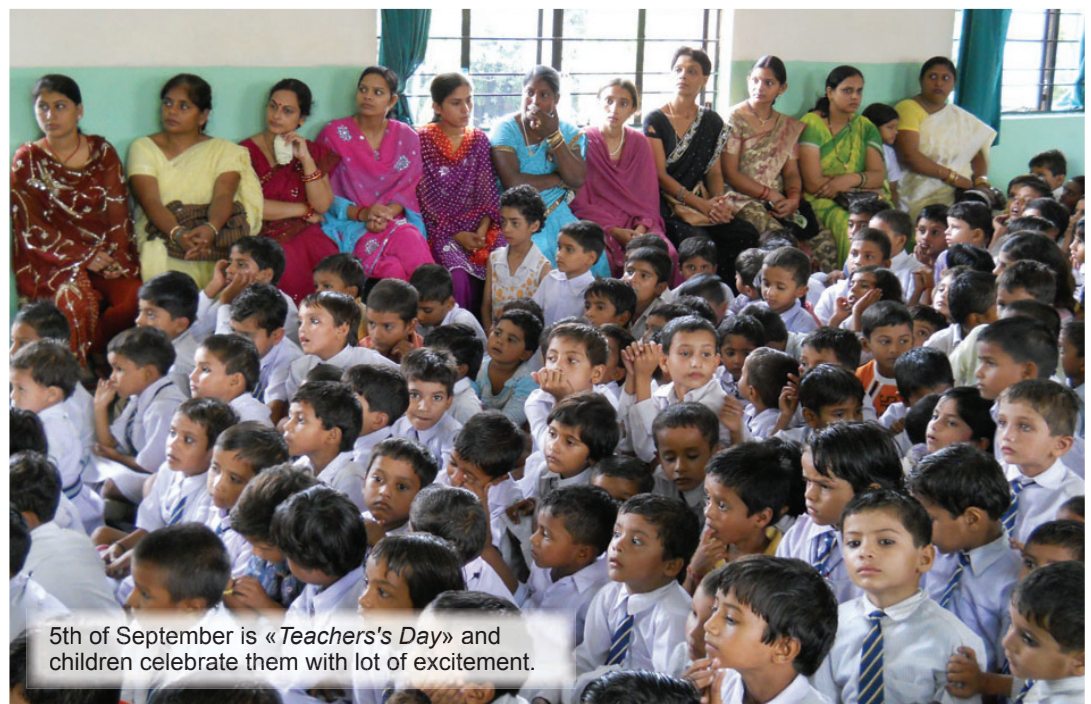
5th of September is «Teachers's Day» and children celebrate them with lot of excitement.

Last few years our social workers have been motivating the villagers to send their children to school. The feedback from them this year shows a big change in their attitude. There was a big rush for new admission and we had to send back many children. Though our target for the academic year