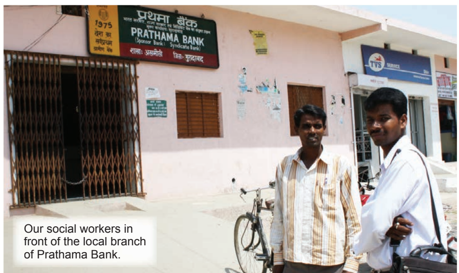
Our social workers in front of the local branch of Prathama Bank.

The word « Diwali » means a row of lamps. It signifies the victory of Goodness over evil. The celebra-