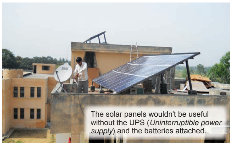
The solar panels wouldn't be useful without the UPS (Uninterruptible power supply) and the batteries attached.

Sometimes, people, here in Belgium, ask why we don't install more solar panels... Actually, in the school, the energy given by the solar panels has to be stored into batteries to be able to use it when it is required. In Belgium, during the night or when the weather is cloudy, we can count on the public electric network to supply the needed electricity... not there ! The life span of the battery is an average of 5 years and after that period, it has to be replaced. It is an important recurring expense.