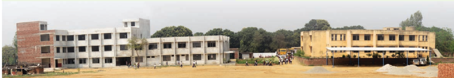
On the right, the Primary block, on the left the first wing of the Secondary block consisting of 16 class rooms out of which, 3 class rooms are used for social work on the ground floor. The remaining area consist of laboratory, library, computer lab, main administrative block and staff room.

Though we plan to start with the ground floor only, provision is there to add a first floor and a second floor like in the first wing.