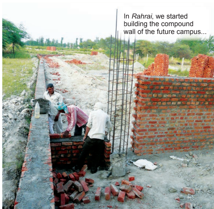
In Rahrai , we started building the compound wall of the future campus...