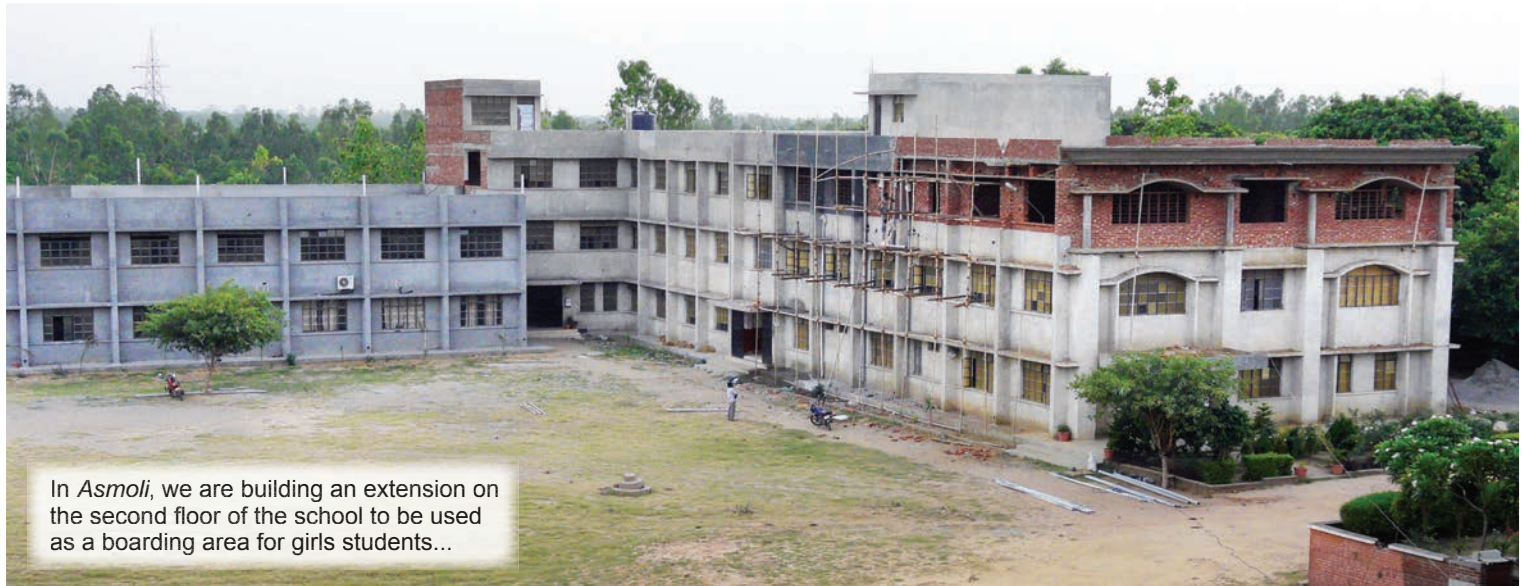
In Asmoli, we are building an extension on the second floor of the school to be used as a boarding area for girls students...

school. He stayed in the school campus and took maximum benefit of the facilities given to the students.