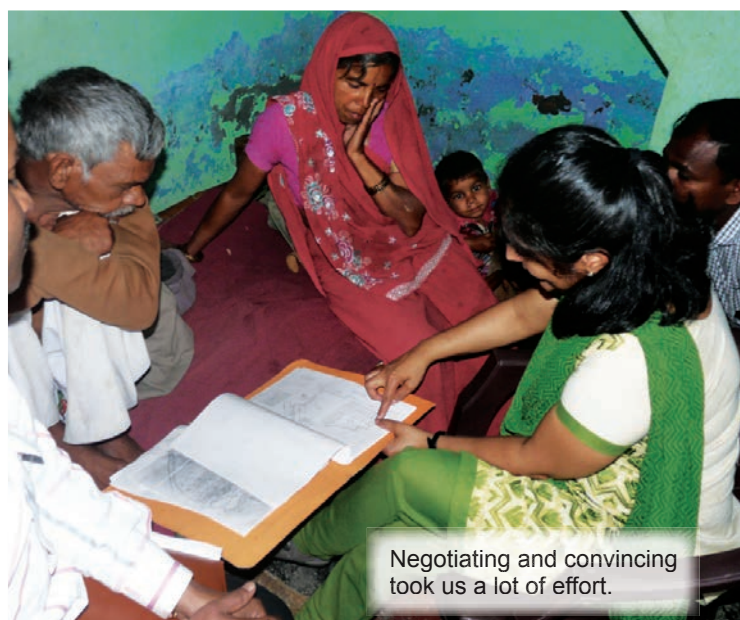
Negotiating and convincing took us a lot of effort.

As you learned from the last news letter, we had bought a piece of land for the new project in Rahrai . Though the land was just enough for a school project, the possibility to expand the project in the future was not possible with it. So we decided to buy the adjacent land before starting the construction.