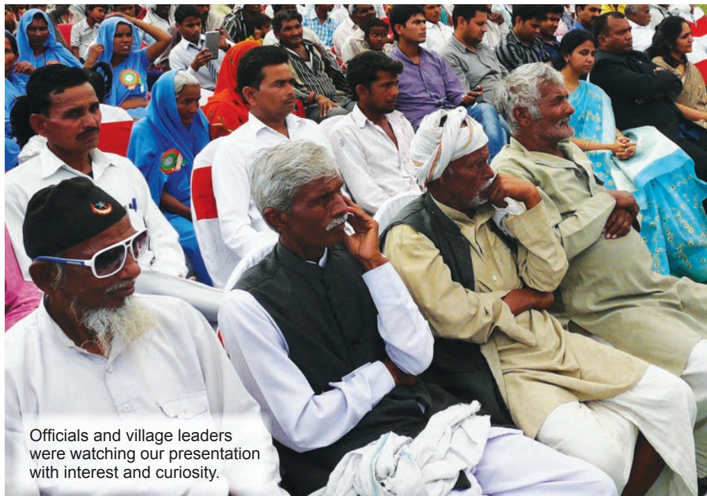
Officials and village leaders were watching our presentation with interest and curiosity.

Though it was vacation time for the children of Saint-Anthony's school, Asmoli , they were happy to perform cultural programs. Staff and women's group from Asmoli also participated in it. One of the senior member of the women's group delivered a speech to share her experience during the last 10 years.