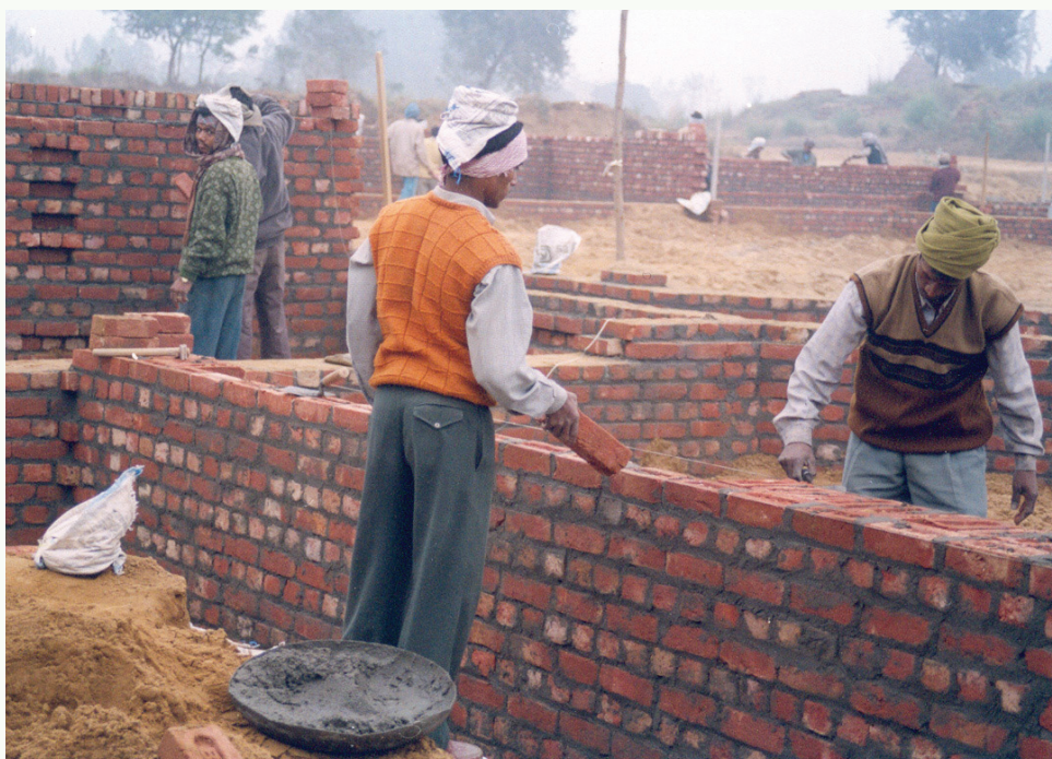
The villagers at work for the construction.

well-equipped residential quarters for the teachers. Teachers for special subjects will have to come from distant places, and they may find it difficult to put up with extreme climatic conditions, with the lack of electricity and water etc. We intend to provide decent quarters with reasonable facilities for teachers and other staff members, so they can stay with the school long-term without having to look out for the first opportunity to leave because they can no longer