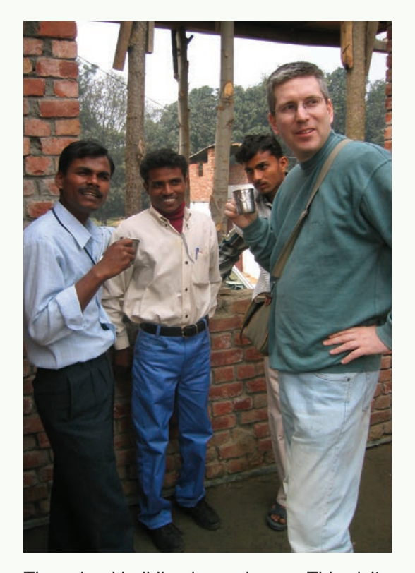
The school building is coming up. This visit made me convince that our presence and work will bring a big change to the population there and it has already started...

Post Office : Bruxelles X Authorisation : P 304122