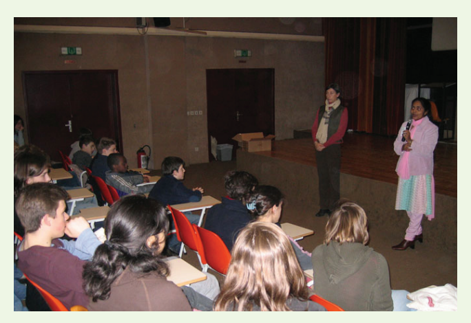
Conscientization about the reality of the hard life of the children in the poor countries is part of our mission. We were happy to have a chance to develop this topic in front of these 800 belgian children who will be leading our country tomorrow..

The demand for the work is increasing as the number of children in colonies and in Saint-Anthnony's School are increasing. To cope with the present needs we approached the school Saint-Boniface in Brussels for a helping hand in our Mission and the School was more than willing to do an action for the Lenten Season and to raise some fund for the children in Saint-Anthony's School . The charisma of Saint-Boniface is well known and we thank the teachers, the students and the staff for their willingness to support us!