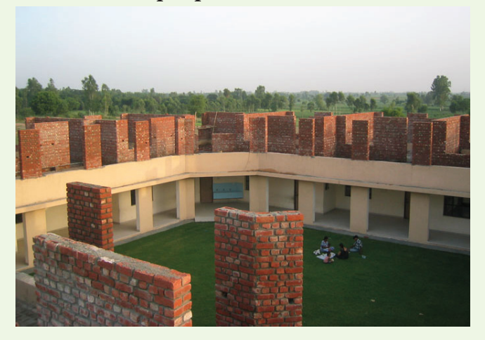
We begun the construction of the first floor of the Saint-Anthony School (Dugawar, India) during the school vacations (may-june).

In the last newsletter we did write about the fact that new workers joined us for the village works. They have been also doing surveys, meeting people from house to house to have a clear picture of the villagers life. It was found that there are many people affected by communicable diseases and the health of the people is very poor. The staff suggested us to organize Health camps in the villages so that the villagers can come and get examined by the medical doctors. Another area where there is a felt need to touch is to support the public Schools which are dysfunctional. The only way we can reach out to these schools are to motivate all the parents to send their children in the school for good attendance and appoint new local staff who can teach these children and help the existing staff and organize the better functioning of the local schools. Since it is a new start, it would be better to start in 5 villages (a population of 25 thousand people).