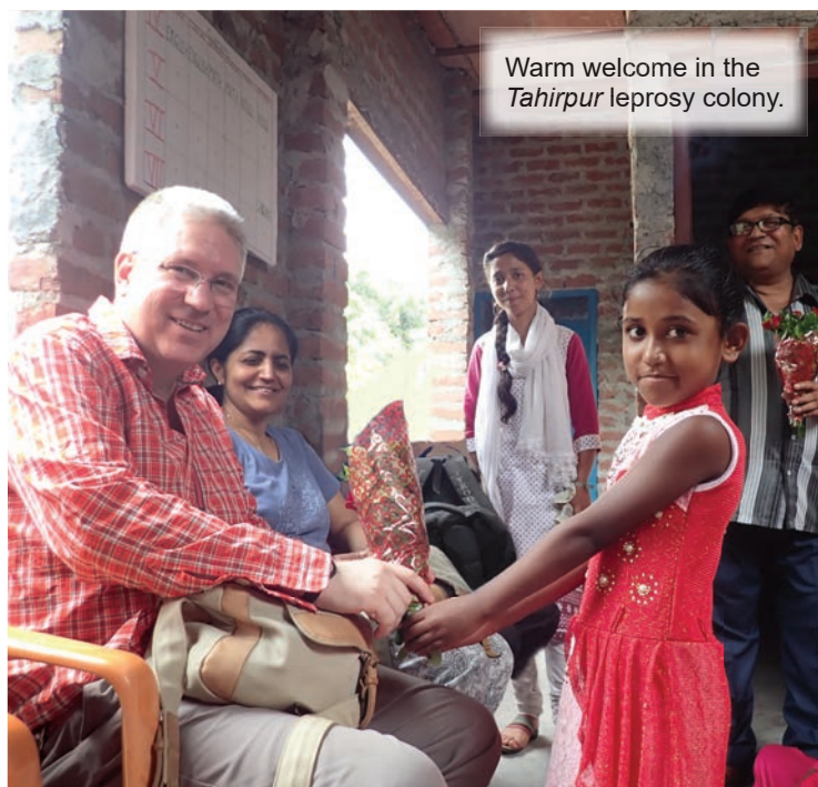
Warm welcome in the Tahirpur leprosy colony.

Just before I reached the school, the computer system crashed badly in the St. Anthony's