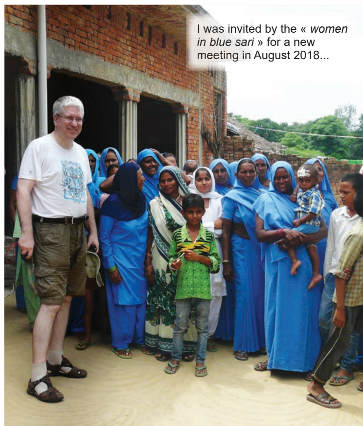
I was invited by the « women in blue sari » for a new meeting in August 2018...