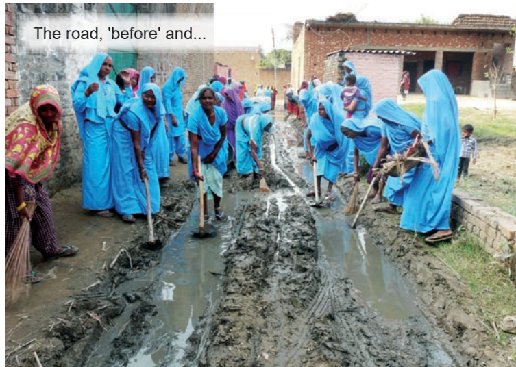
The road, 'before' and...