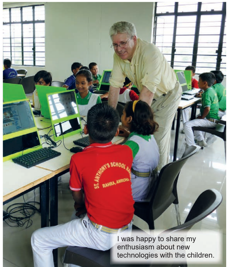
I was happy to share my enthusiasm about new technologies with the children.

one of our ex-students who is doing graduation in computer science in Moradabad . He has a good experience of using the XO computers from primary classes and Raspberry Pi computers present in higher classes. I introduced the Pi-Top system to him and he understood how to set it up. He assembled and installed all of them