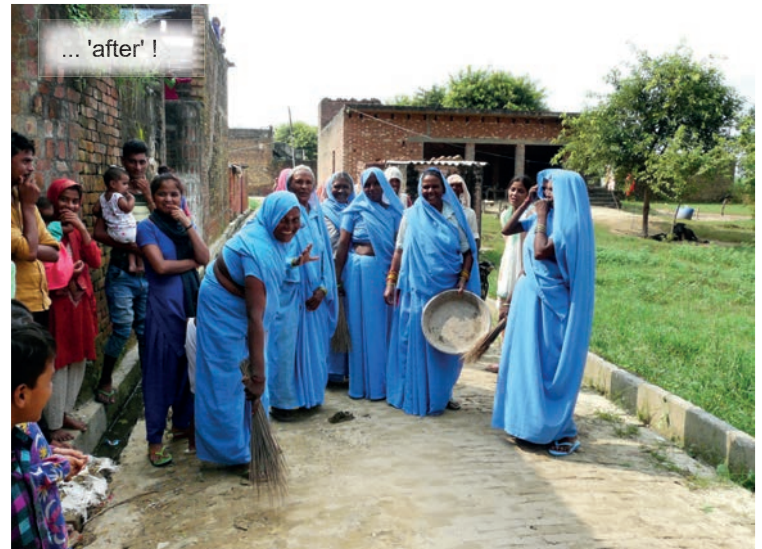
... 'after' !

get the work done. As they expected, the SDM listened to them and agreed to do the needful without delay. Indeed, the Pradhan was forced to start the work.