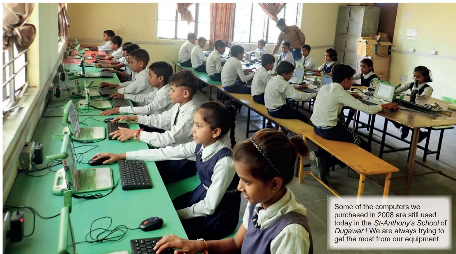
Some of the computers we purchased in 2008 are still used today in the St-Anthony's School of Dugawar ! We are always trying to get the most from our equipment.

before I reached India in the month of July. It is always rewarding to see our own students growing up and becoming capable of contributing to our project.