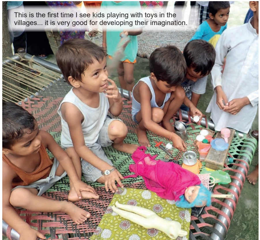
This is the first time I see kids playing with toys in the villages... it is very good for developing their imagination.

empowered and participate in social activities. They understand the importance of properly caring for their children, keeping them clean, sending them to school and now, they even start to play with toys ! All these progress indicate us of a new generation that will make their lives happier.