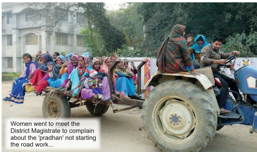
Women went to meet the District Magistrate to complain about the 'pradhan' not starting the road work...