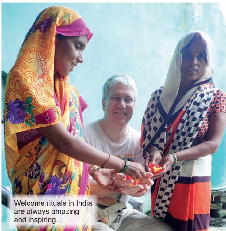
Welcome rituals in India are always amazing and inspiring...

There was no sign of action from the side of Pradhan even after few months. It seemed that he was not ready to yield into the demand of these women. The situation was very frustrating to our women's group, and they met again to discuss and take further action. They went to meet him in his office and confronted him. He put them off by saying that he did not win the election with their votes, and that its not his priority. Our women really got offended and they challenged to make him do the work. They decided to meet the Sub Divisional Magistrate (SDM) in the city to complain about the attitude of this Pradhan . The SDM is the highest authority to solve conflict and in the past they had approached him for different issues and they had got the work done. They had confidence that the SDM office will understand them and