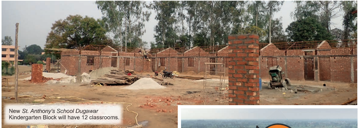
New St. Anthony's School Dugawar Kindergarten Block will have 12 classrooms.