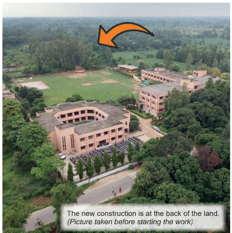
The new construction is at the back of the land. (Picture taken before starting the work)

Since the Kindergarten section will move to this new area, the old primary building which has 18 classrooms can occupy classes 1 to 5. This building has the capacity for 700 students.