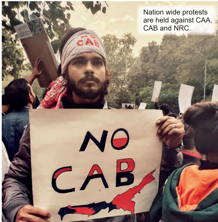
Nation wide protests are held against CAA, CAB and NRC.

On 5 August 2019 Government of India revoked the special status given to Jammu and Kashmir , a Muslim majority state in India, located in the northern part of India bordering Pakistan. It was the demand of Hindu nationalists since the 1950. The Kashmir Valley was placed under a virtual lock down with all the communication lines cut and political leaders placed under house arrest. The local protests were brutally suppressed. The life of 11 million Kashmir people is not the same since then.