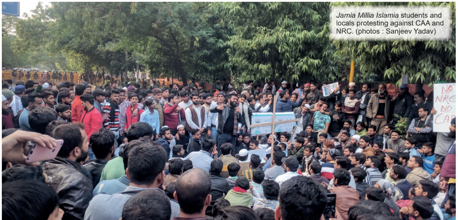
Jamia Millia Islamia students and locals protesting against CAA and NRC.

The violence in Delhi began after a local BJP politician, told a rally that unless police cleared the streets of protests against the Citizenship Amendment Act (CAA), he and