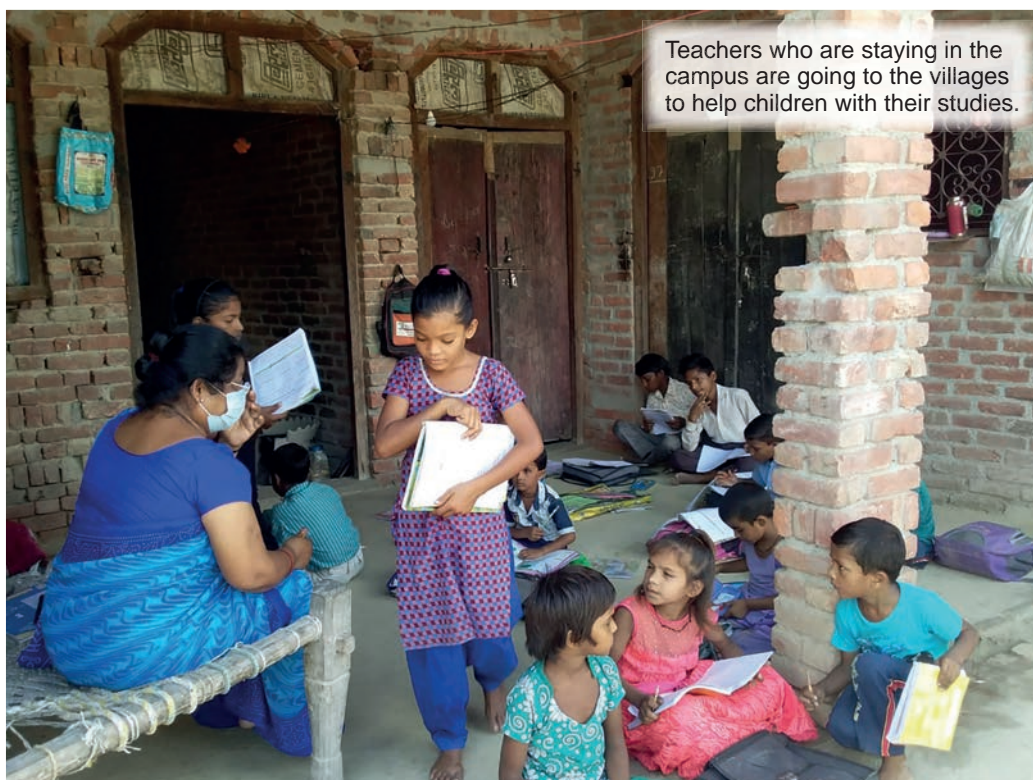
Teachers who are staying in the campus are going to the villages to help children with their studies.

The instructions given by the government and the supreme court are to stay closed, conduct online classes and get the fees from the students to pay the teachers. Parents who are not happy are appealing against this decision. Those who don't want to pay are even blocking their children from attending