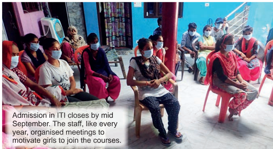
Admission in ITI closes by mid September. The staff, like every year, organised meetings to motivate girls to join the courses.