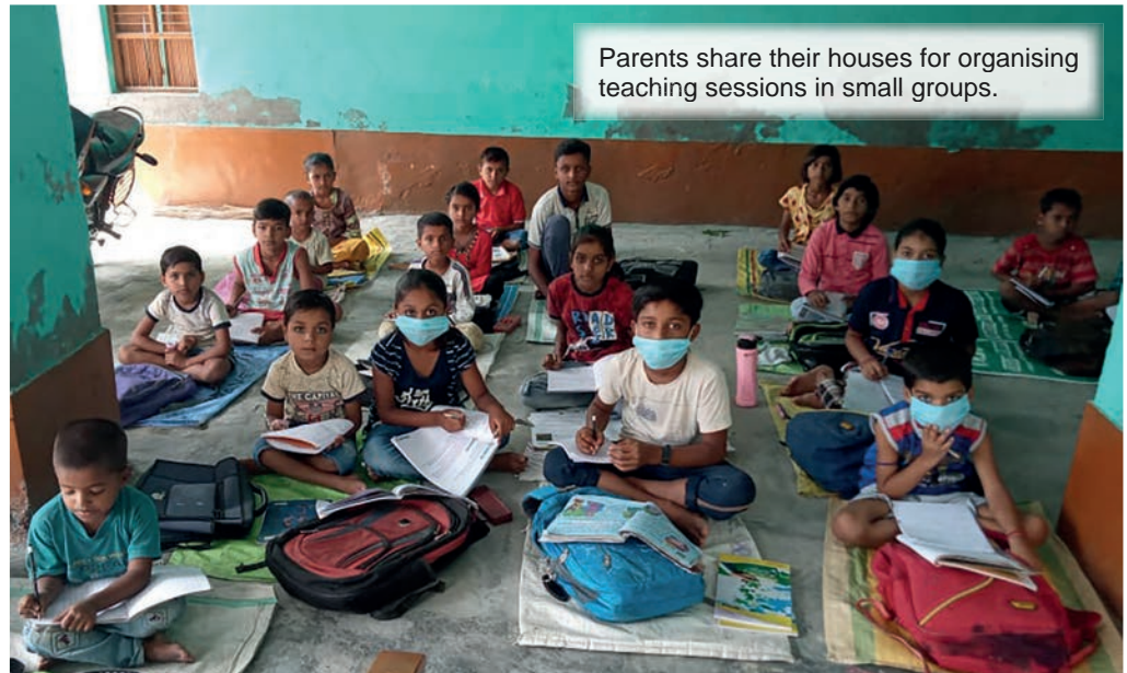
Parents share their houses for organising teaching sessions in small groups.

As many as 120 million students, 47.5% of total students in the country, attend private schools, making India's private school sector the third-largest school system in the world. Having the schools closed for almost