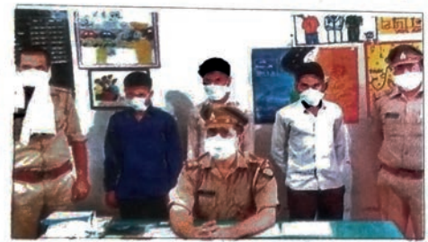
हसनपुर में खुलासा करते अधिकारी।

हजारी)। होली के य किशोरी के साथ शिश में नाकाम गांव कों ने गन्ने के खेत र उमकी हत्या कर । ने तीन आरोपियों कर घटना का है। घटना के बाद को सूचना दिए ही पो पक्ष के लोगों ने में अंतिम संस्कार था। तीन दिन बाद ना को जानकारी हुई