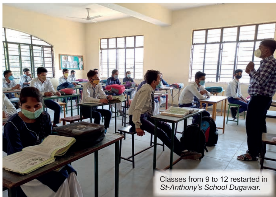
Classes from 9 to 12 restarted in St-Anthony's School Dugawar.

locality, Kerala and Tamil Nadu are back in the campus. Transportation facility (busses) has not resumed yet : students have to reach on their own. Campus accommodation is proposed to those who face transportation difficulties. Unfortunately, children from classes up to 8 are only allowed to have online classes. Our local teachers continue however to do the class here and there in the villages.