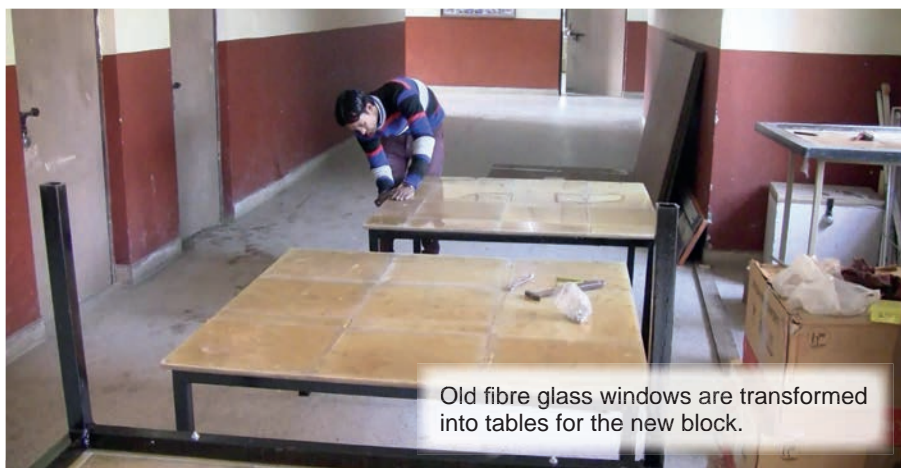
Old fibre glass windows are transformed into tables for the new block.