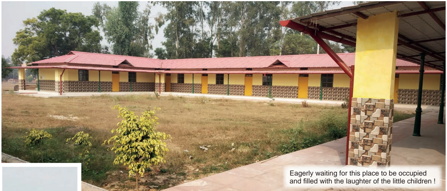
Eagerly waiting for this place to be occupied and filled with the laughter of the little children !