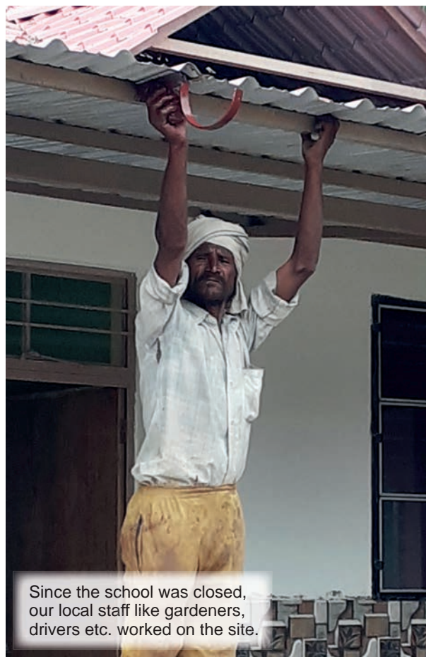
Since the school was closed, our local staff like gardeners, drivers etc. worked on the site.