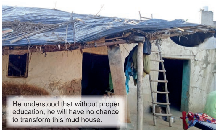
He understood that without proper education, he will have no chance to transform this mud house.

The evolution of the coronavirus epidemic in India is not similar to what we see in Belgium. No second wave, but after a decrease in cases, the curve tends to flatten. Here too, only the arrival of a vaccine will make it possible to return to a more normal life.