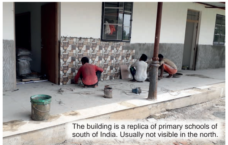
The building is a replica of primary schools of south of India. Usually not visible in the north.

The foundation work and the first structure of the building was ready by the end of March and the remaining work was completed after the lockdown was eased, during the last three months. As mentioned earlier, the building with tin sheet roof reduced the construction cost. This type of buildings are common in South India, but not existing in North India. Roy Mathews , our director, who comes from the South has supervised and used his know-how in this building. The iron roofing work was given to the welder in the village of Asmoli and the work was closely supervised. The furniture for the children were made out of the old window pans of our main building which had lost their colours. Roy Mathews has transformed