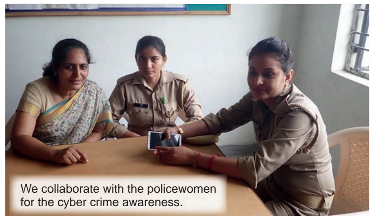
We collaborate with the policewomen for the cyber crime awareness.