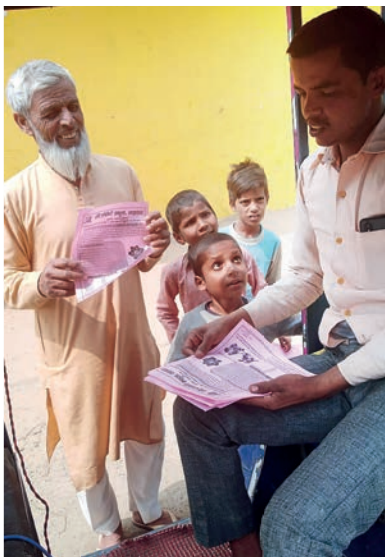
We started already the admissions process for the St-Anthony's school of Jadwar.

It is very important for the project to find a stable and capable person who has to develop field work along with the education of the children.