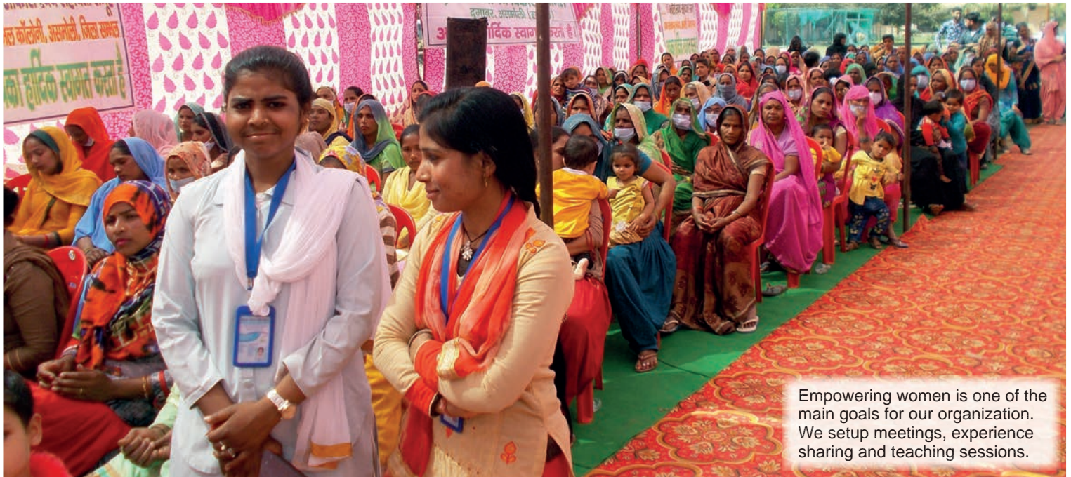
Empowering women is one of the main goals for our organization. We setup meetings, experience sharing and teaching sessions.