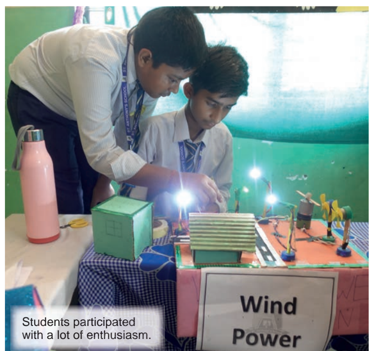
Students participated with a lot of enthusiasm.