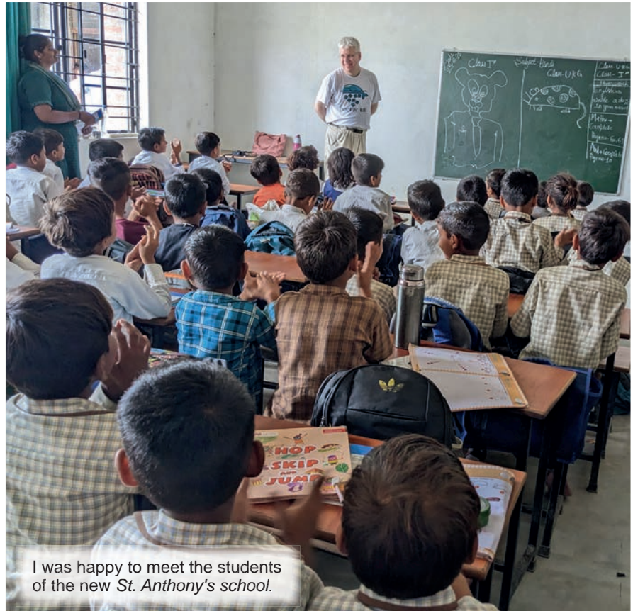
I was happy to meet the students of the new St. Anthony's school.

We were happy to be in the new St. Anthony's school in Jadwar in mid July to meet the staff and the children. The situation at that time was very challenging. On one side, there were the grilling machines and the workers, on the other side the overcrowded classrooms. Even if the fans were running, the rooms were so warm and the hot air was circulating. Though there was heavy rain at intervals, the temperature was really high and with the humidity it felt even hotter. However, for those who are in the project, everything seemed normal. There was much joy on the faces of the children and the staff. I was really happy to see them adapting to the situation without a word of complaint. It seems like the capacity to adapt to the difficult situations is inherent in Indians.