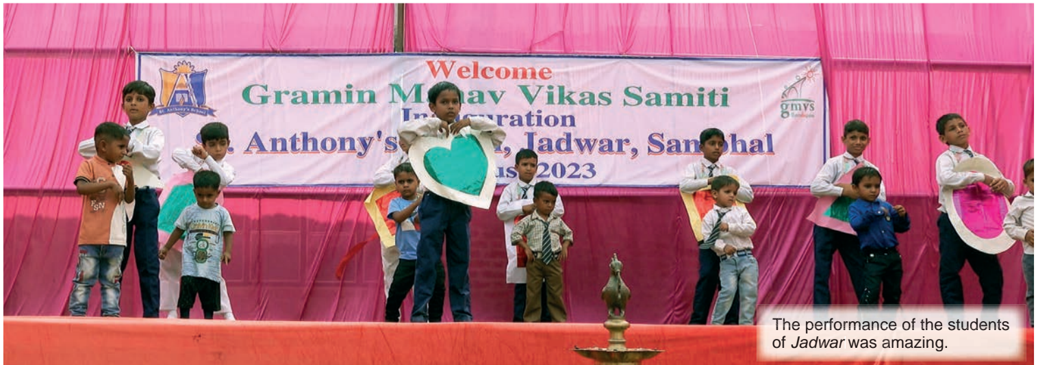
The performance of the students of Jadwar was amazing.