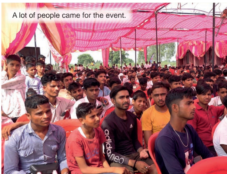
A lot of people came for the event.