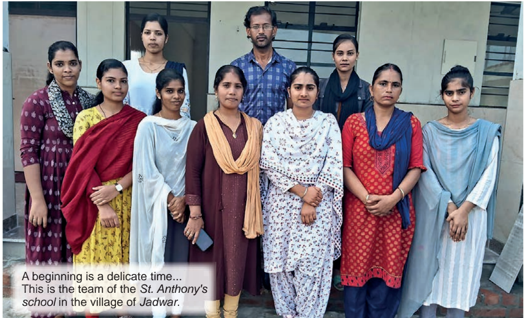
A beginning is a delicate time... This is the team of the St. Anthony's school in the village of Jadwar .