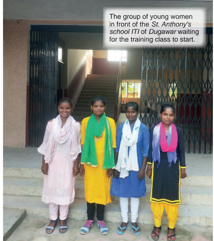
The group of young women in front of the St. Anthony's school ITI of Dugawar waiting for the training class to start.

in the government portal so they could get a scholarship for the first one year of their job. This way, they get a sum given by the government which is added to their salary. After successfully completing the apprenticeship for one year, they will be included in the list of eligibility and preference for government jobs.