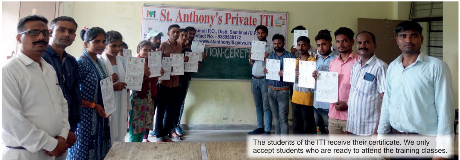
The students of the ITI receive their certificate. We only accept students who are ready to attend the training classes.