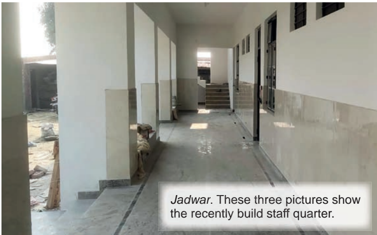
Jadwar. These three pictures show the recently build staff quarter.

After the monsoon, the play ground was flooded and there was no way out for the water. So, a big part of the land had to be raised with mud. Getting mud is not always easy. The neighbors wanted to bring down the level of their land which was bit raised and we took the opportunity to buy the mud from those plots.