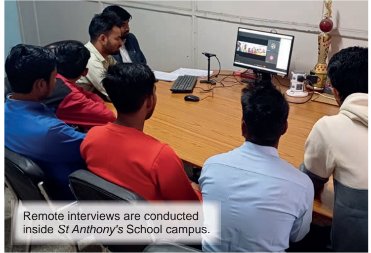
Remote interviews are conducted inside St Anthony's School campus.

In Mach 2023, in collaboration with the government, St. Anthony's ITI organised a big job fair. Many government officials were present at this program to encourage the youth. Several representatives from the companies came for the job interviews and many candidates were selected for jobs. Interview of all those candidates were done on the same day and for the final selection they were called to their main offices.