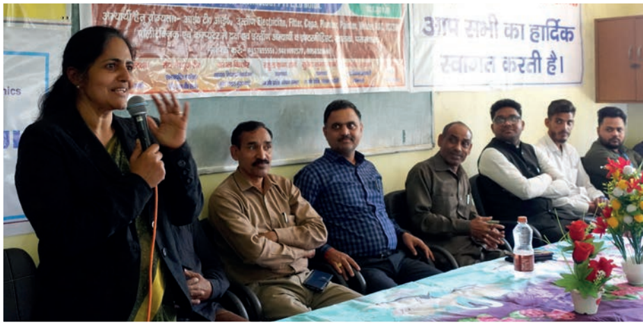
In March, a big job fair was conducted in collaboration with the government in our school.

Dhampur Sugar Mill factory is situated 3 km from St. Anthony's school campus, Dugawar. This Mill was started in 1993. At that time, this factory was manufacturing sugar from sugar cane and eventually they started also manufacturing electricity and ethanol. Many of our passed out students are working in this factory.