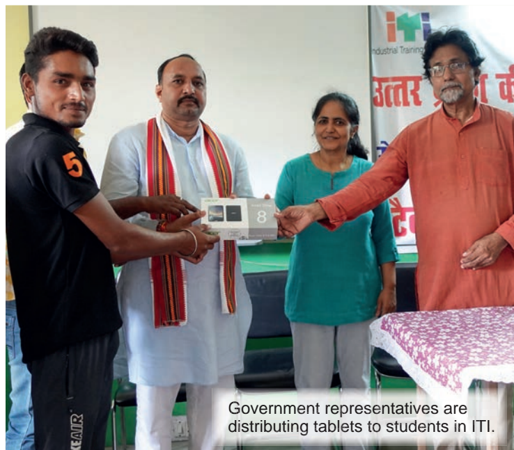
Government representatives are distributing tablets to students in ITI.

A lot of investment is also done by the government to increase the interest of ITI students towards the Information and Technology sector. Recently, all the students in our ITI received tablets from the government of Uttar Pradesh . The government representative came to our school to distribute these tablets to all the students. Of course, we can't rule out a bit of electioneering.