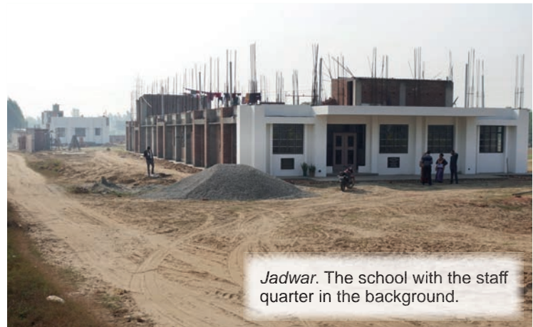
Jadwar. The school with the staff quarter in the background.