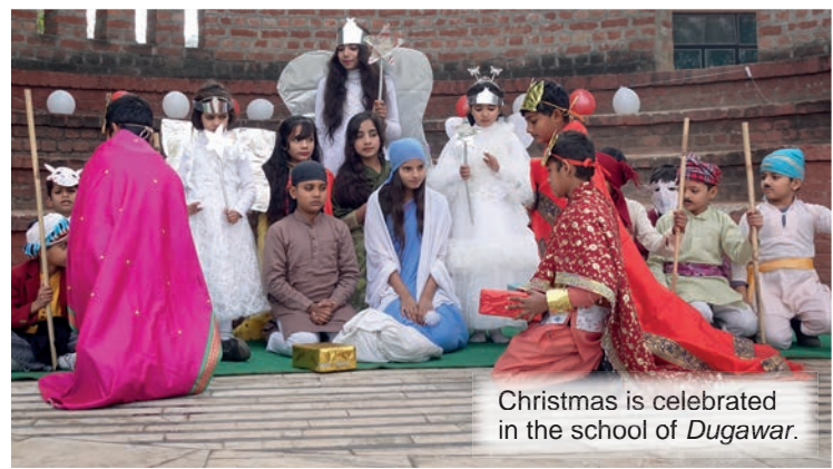
Christmas is celebrated in the school of Dugawar .

Along with all the beneficiaries, we wish you a Merry Christmas and a Happy New year !