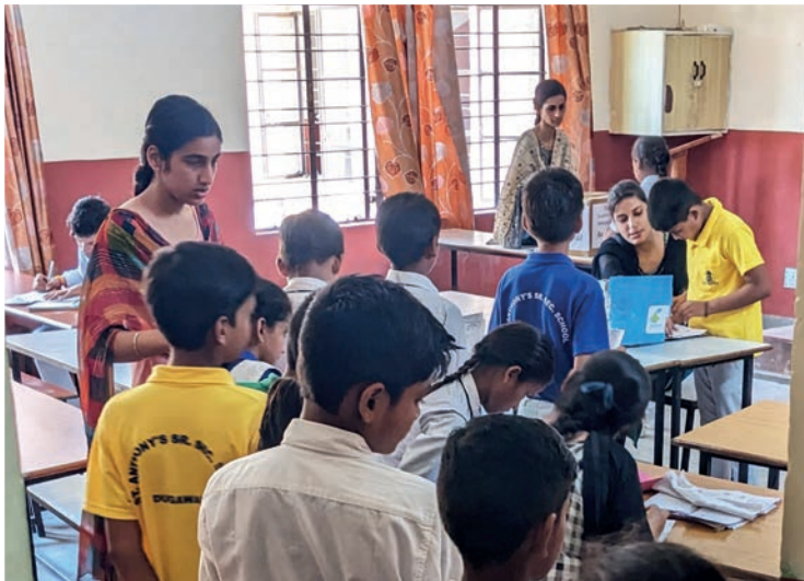
School representatives's elections are organized in St Anthony's school following strict rules.

While the adults vote for their political representatives, students of St. Anthony's cast their vote to elect their head boy and head girl and their representatives for the next term. This exercise not only helps them learn about their responsibility but also to help them bring changes in their villages. They could be attuned to the happenings in their villages and could influence their families and neighborhood with a rational thinking.