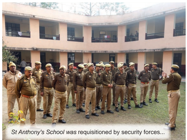
St Anthony's School was requisitioned by security forces...

Although Saint Anthony's is a private school, we were obliged to accommodate Modi's security forces in the school and the