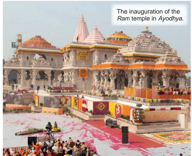
The inauguration of the Ram temple in Ayodhya .

Inauguration of Ram temple by the prime minister Modi on January 22 in Ayodhya was a national event. All the BJP ruled states have shut down schools and colleges and declared a full or a half-day government holiday to encourage people to watch the ceremony. Even the Indian stock markets were closed ! Modi asked people to light up lamps and party supporters to put up saffron flags with images of the Hindu god Ram on their rooftops. Many Hindus believe that the Muslim