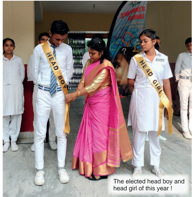
The elected head boy and head girl of this year !

Though many students apply, final selection is done by an election committee, after scrutinizing their disciplinary records. The campaign in the campus gets the attention of the whole school and it is the main talk of the day. The candidates are given the last hour of the school to go to different classes and to present their agenda. Debates are conducted in the assembly on the last day. On the election day, each candidate has his/her team in the election booth and at the ballots counting to make sure the smooth functioning of the voting. Votes are counted at the end of the day and the results announced in next day's assembly.