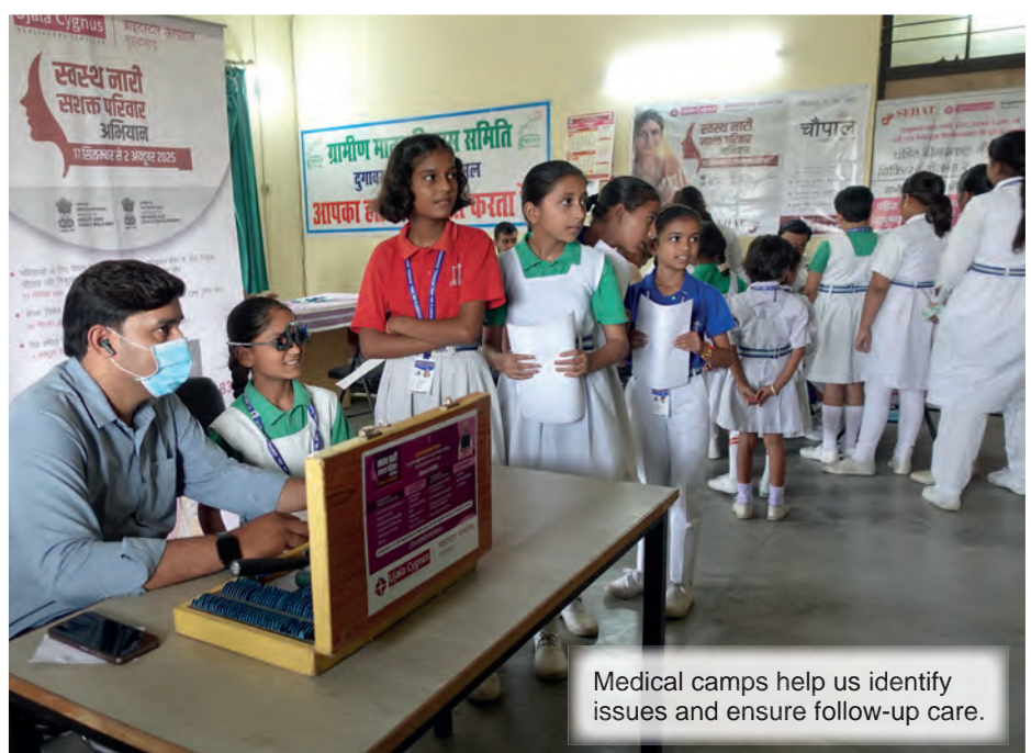
Medical camps help us identify issues and ensure follow-up care.

In the month of November we organised a medical and eye camp for all the children in our school. In many rural families, eye problems are overlooked simply because parents do not recognise the signs. Children often struggle to see the blackboard or read their books, but no one realises they need help. During the camp, several students were iden-