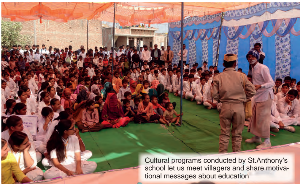
Cultural programs conducted by St. Anthony's school let us meet villagers and share motivational messages about education

we organise rallies and small cultural programs in the villages to raise awareness about the importance of education — especially for girls. These activities help families understand the value of sending their children to school and strengthen our relationship with the community. This is the same approach that brought such positive results in the project of Dugawar over the years, and we trust it will lead to similar growth and transformation in Rahrai .