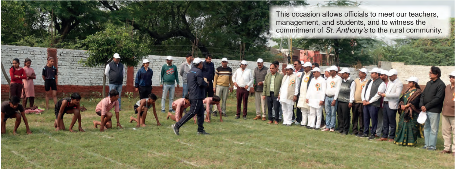
This occasion allows officials to meet our teachers, management, and students, and to witness the commitment of St. Anthony's to the rural community.

The Annual Sports Day of this year was celebrated with unusual vigour. For the first time in 22 years, our campus hosted such a large gathering of high-level authorities. The Chief Guest was the Member of the Legislative Assembly from the ruling BJP, accompanied by senior officials from the education department. Local government school teachers worked hard to prepare their students, and for once, the funds they received for the event were visibly used.