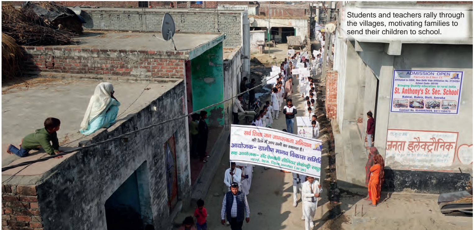
Students and teachers rally through the villages, motivating families to send their children to school.